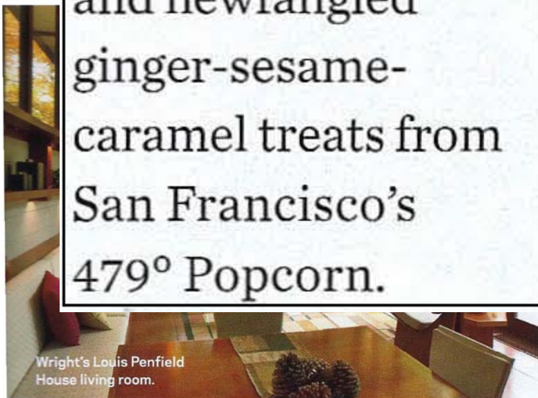
Wright's Louis Penfield House living room.

For sweets, try such old-school favorites as Arnaud Soubeyran's calissons de Provence and newfangled ginger-sesame-caramel treats from San Francisco's 479° Popcorn.